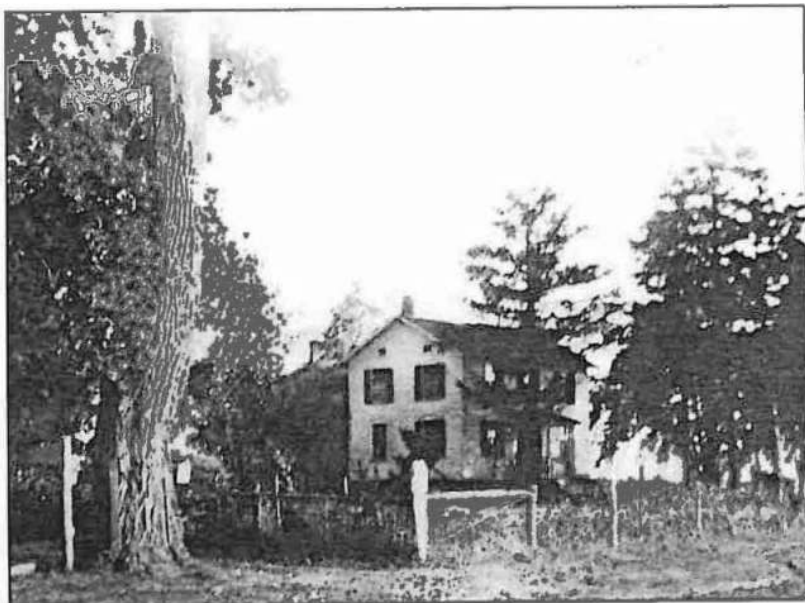
The McCulloh home on the Zook farm.

The author at age eighteen near the time when she left home in Illinois for Pennsylvania.